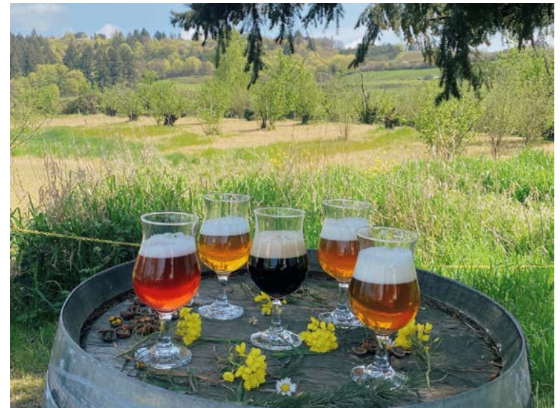
Wolves & People Farmhouse Brewery serves up unique beers in a bucolic setting

A classic small-town dive bar. No frills, just cold beer.