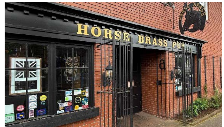
The Horse Brass is one of Portland's original craft beer pubs

Beer bar featuring only Oregon-brewed beers – enough said.