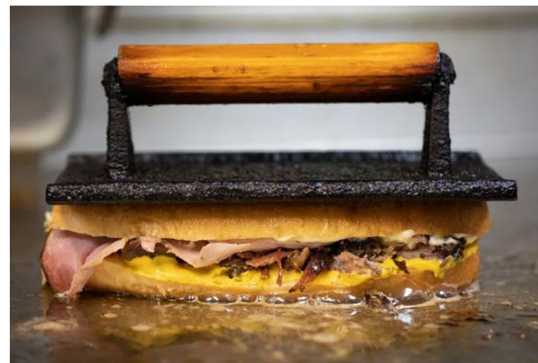
Lardo makes for a great stop between brewery visits.

Exceptional Mexican fare with signature, potato-filled taquitos and tasty cocktails.